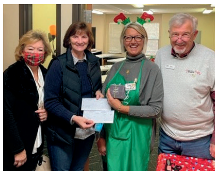
The South Forsyth market center donated $75 Visa gift cards to The Place of Forsyth, who gifted the cards to teens participating in their Holiday House event!