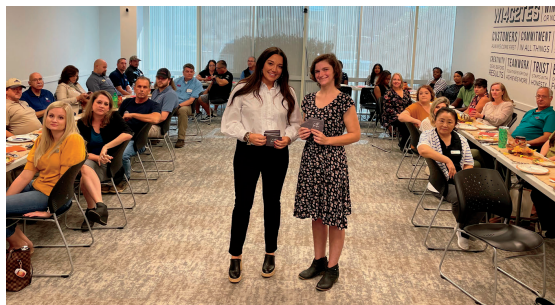
The Augusta market center donated $2,250 worth of Visa gift cards to local teens in need!

The holiday season brings out the generosity of many people, as we all want children to enjoy the magic of Christmas. Unfortunately the teen population is the least supported group this time of year, which is why Kares 4 Kids created our Kards 4 Kids event. $75 Visa gift cards are donated to teens in need, to provide them with some holiday magic of their very own. In 2022, $83,850 in donations were used to purchase cards for 1,118 teens!