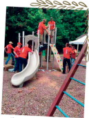
Playground installed at school for autistic children