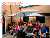
Umbrella for special needs children's playground