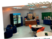
Bronco High School Cafe & Care Closet