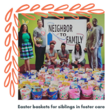
Easter baskets for siblings in foster care

** To start the new year - erase information from previous year and start fresh with your total Flex Funds for the year written in at the top.